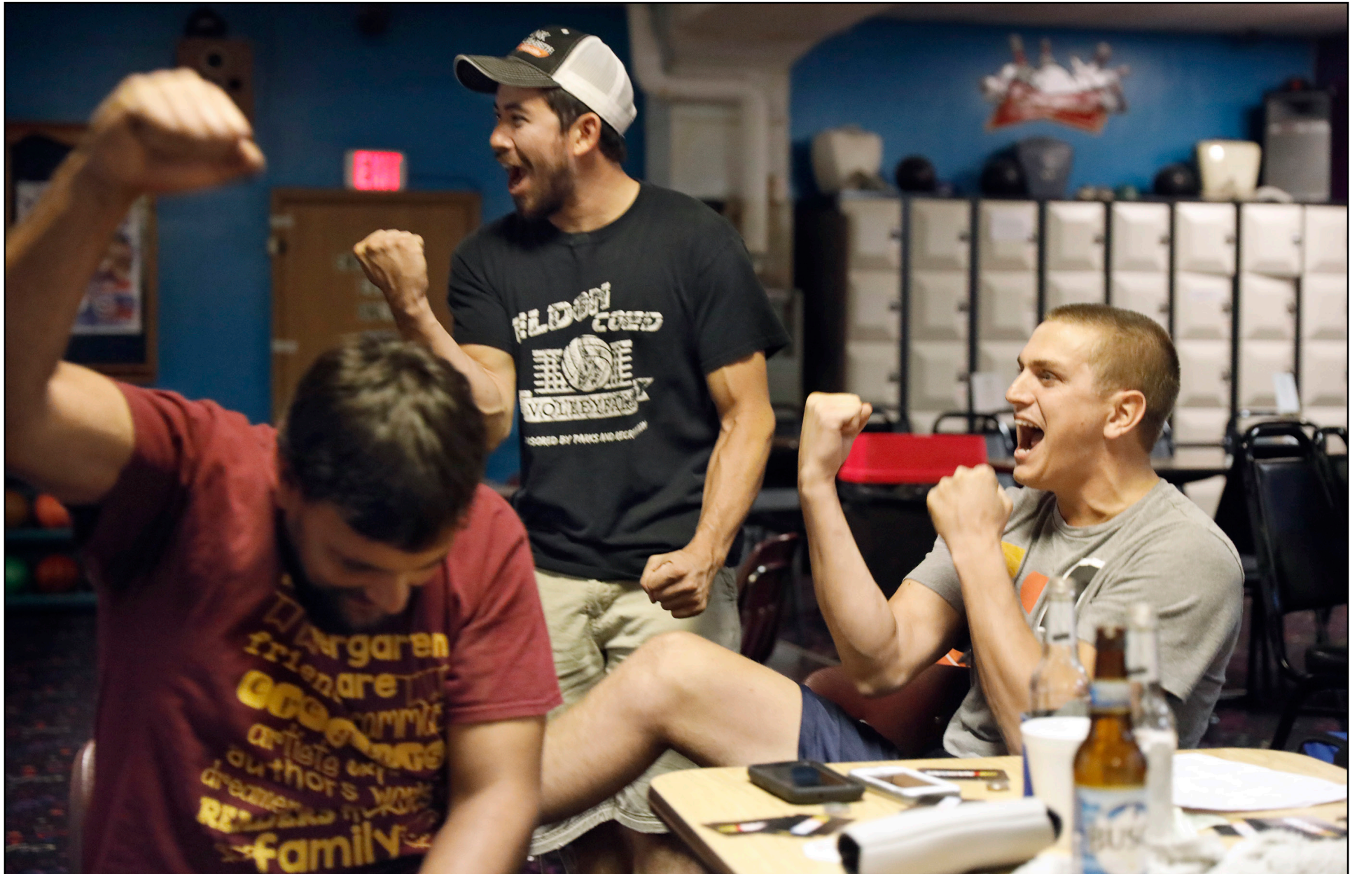
The Pocket Pounders cheer as they clench the win after being down by four pins in the last game of the night at Eldon Lanes.