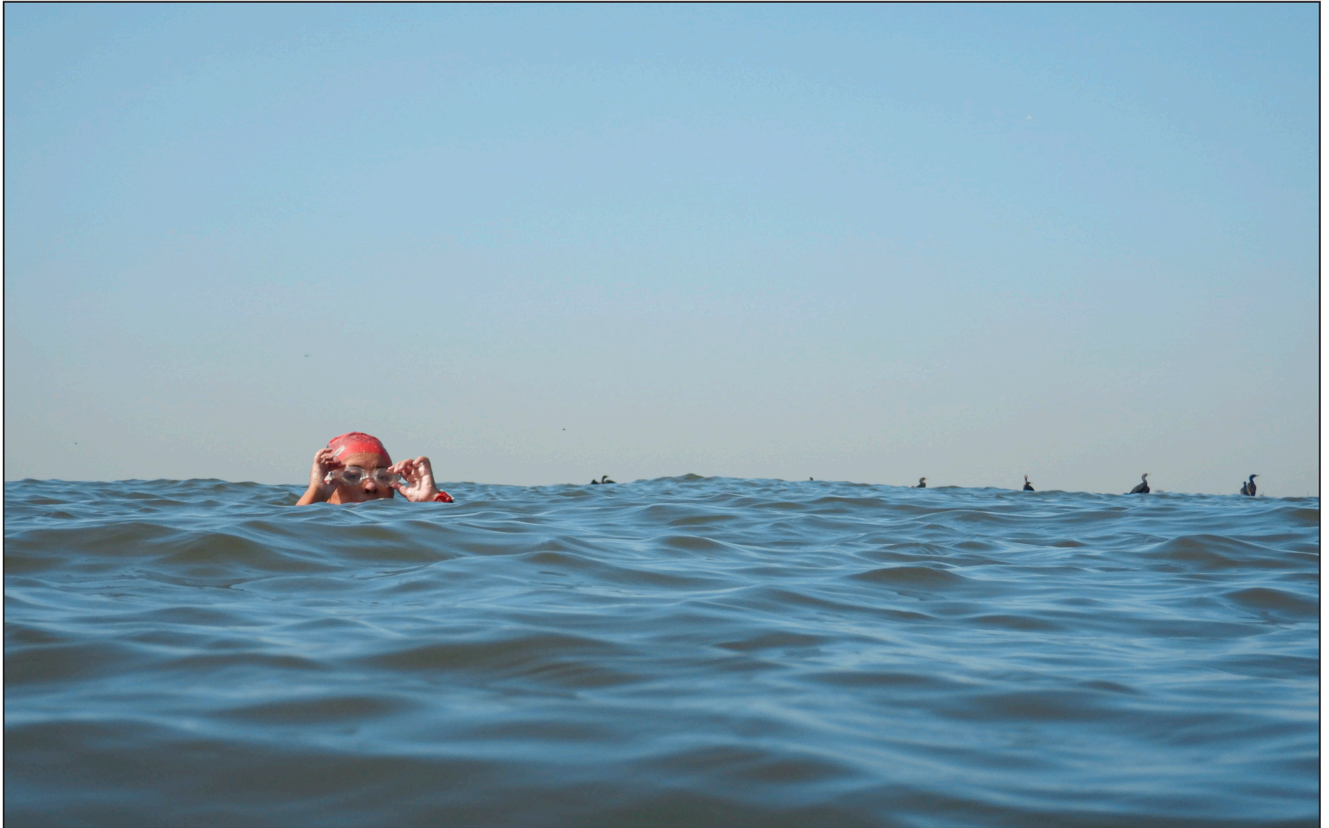
Carpri tries to get a sighting of the land before she swims back to shore. Double-crested cormorants sit on the pier in the background. By Brighton Beach on September 22, 2020, in Brooklyn, New York

The Missouri Photo Workshop | September 23, 2020 | Volume 72, Issue 4